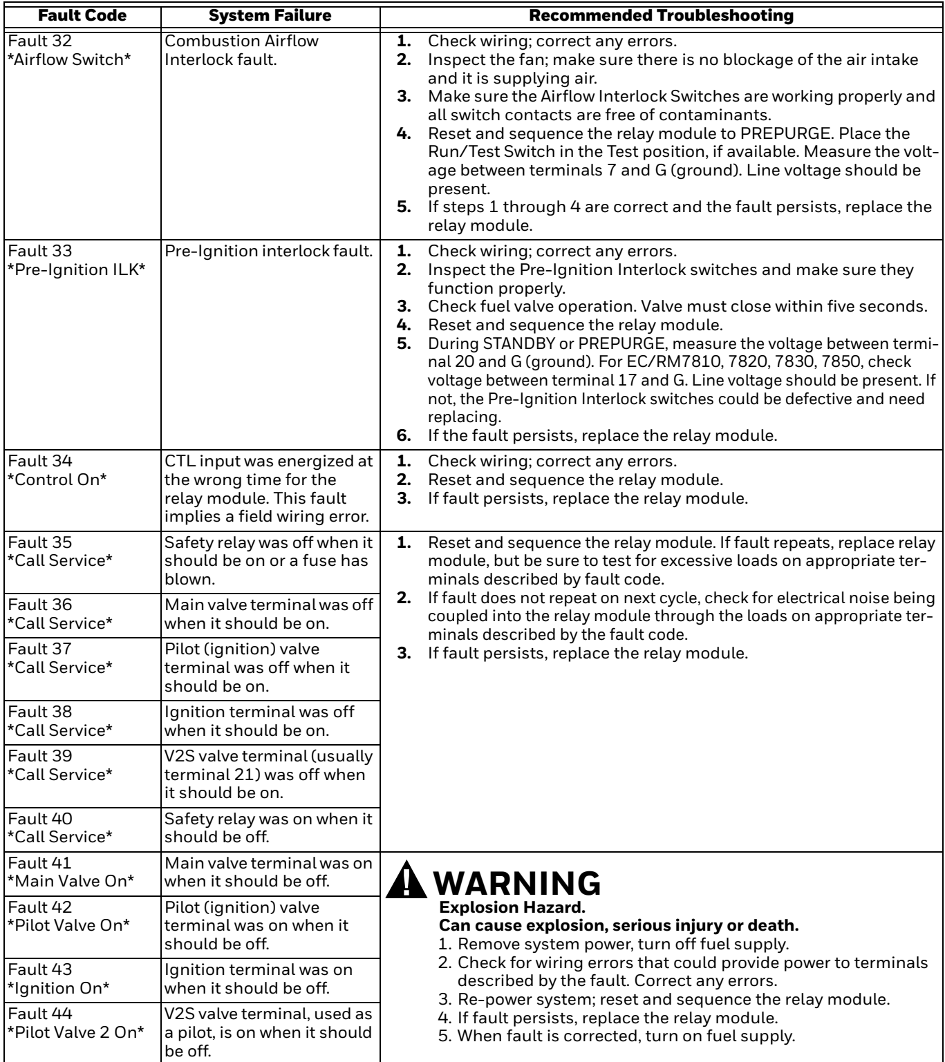
Table 3. Hold and Fault Message Summary. (Continued)