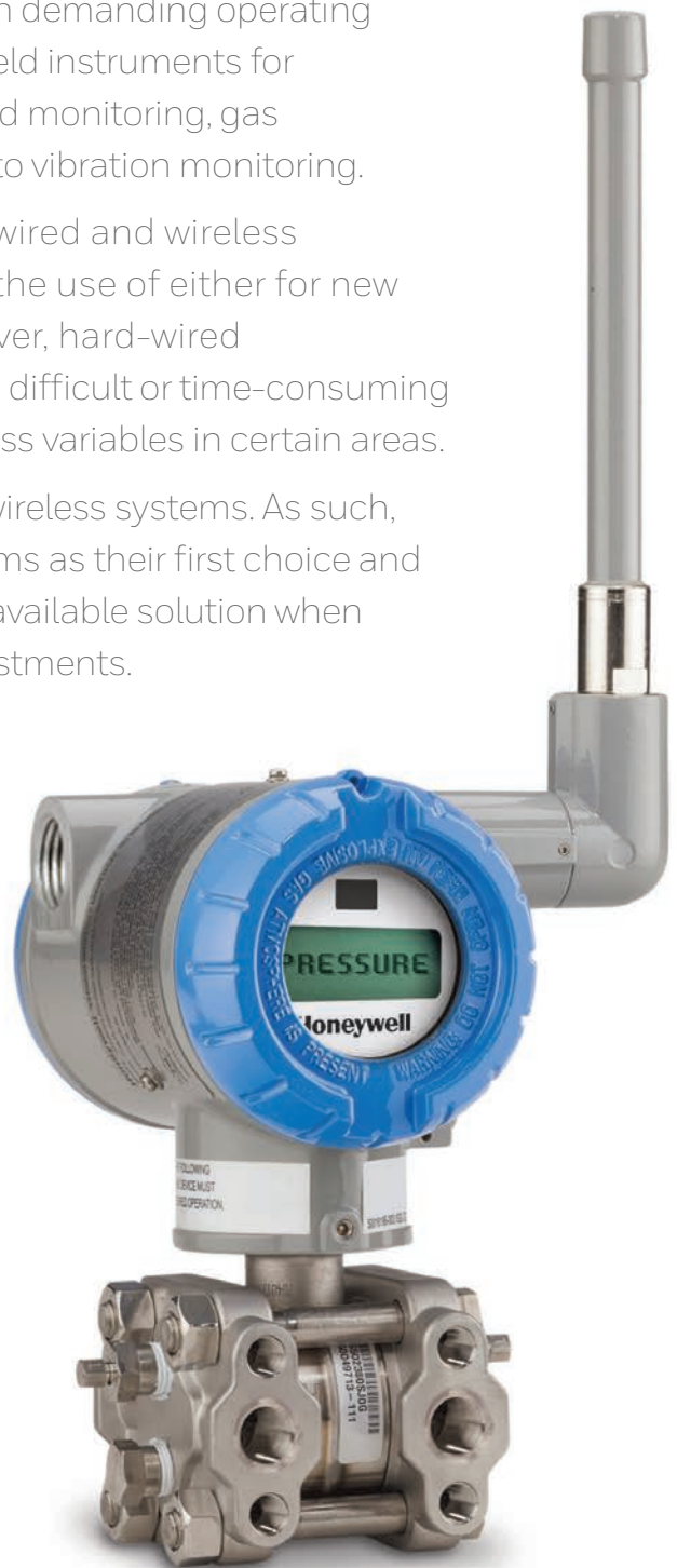
Honeywell SmartLine Wireless Pressure Transmitter